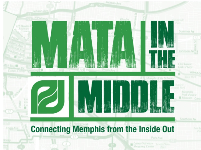
Figure 2: MATA in the Middle Logo

While it was catchy and succeeded in capturing the attention and interest of Midtowners early on in the process, upon further review, “MATA in the Middle” was rejected for another choice. In addition, it was decided that this brand should be something new, separate, and different from the traditional MATA’s brand, logo, colors, etc.