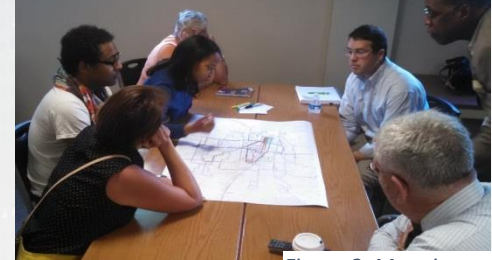
Figure 2: Mapping exercise breakout group